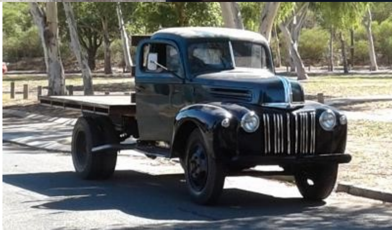
Brad Mills' truck back on the road